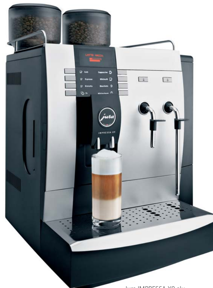
Jura IMPRESSA X9 alu