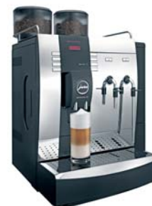
also available in chrome